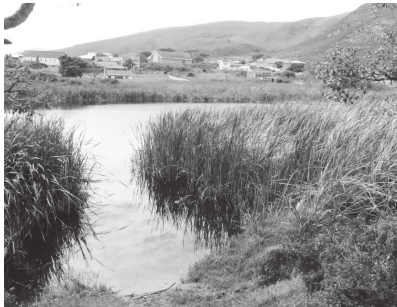
Paddavlei was good grazing land. Today it is a wetland and a bird watching spot.